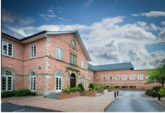
Cavan Crystal Hotel

We has a great annual weekend family get together in The Cavan Crystal Hotel this year.