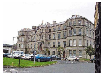
Mary Immaculate College Limerick

This was our first Junior and a lot has been learned a lot from it. We had a bigger turnout than expected and the general consensus was that it was a very beneficial few days for both parents and children. The need for the provision of workshops for siblings was evident and it is something the team will look into..