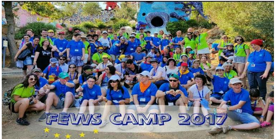
FEWS Team Italy 2017

Wednesday and Thursday were very busy days with the Camp's Olympic Games and trips out to Dinner at Montalto and lunch at Etruscopolis. Everyone took part in the games tug of war, egg & spoon races, sack race and team goal scoring. We had homemade Pizza at Montalto after our trip around the grounds where we saw the wild Boar and Deer. It was